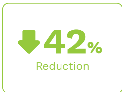
EPIDIOLEX 20 mg/kg/day dose