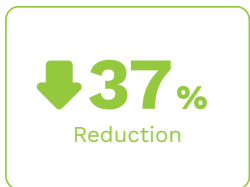
EPIDIOLEX 10 mg/kg/day dose

Monthly drop-seizure* reduction over the 14-week treatment period.